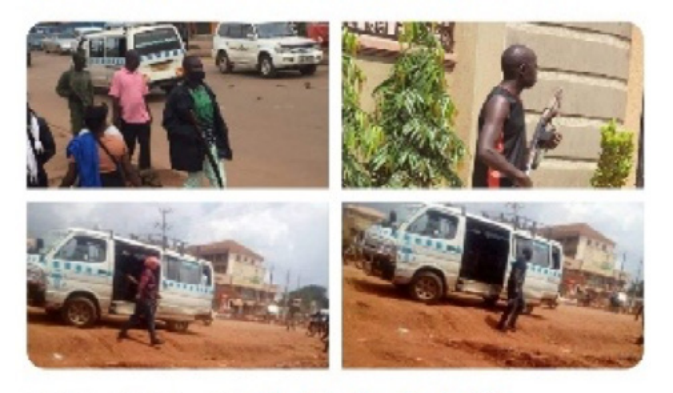
10:51 · 20 Nov 20 · Twitter for Android